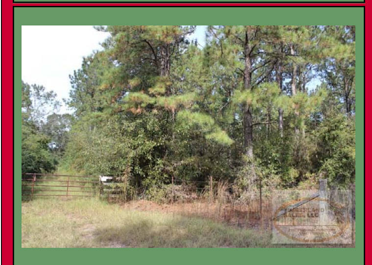
View North from Herbert Thomas Road