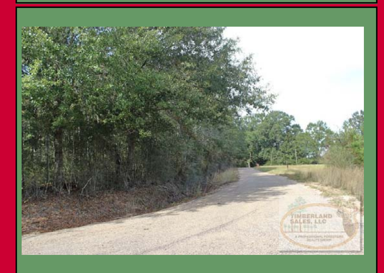
View North of Sunlight Road