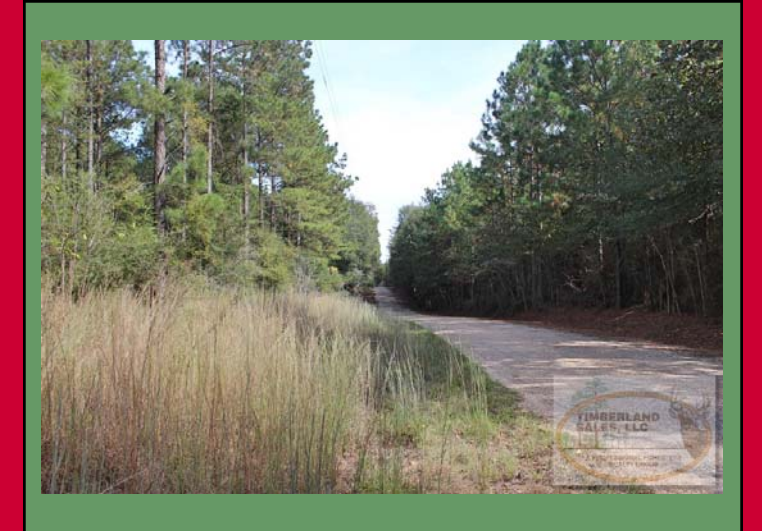
View East from Herbert Thomas Road