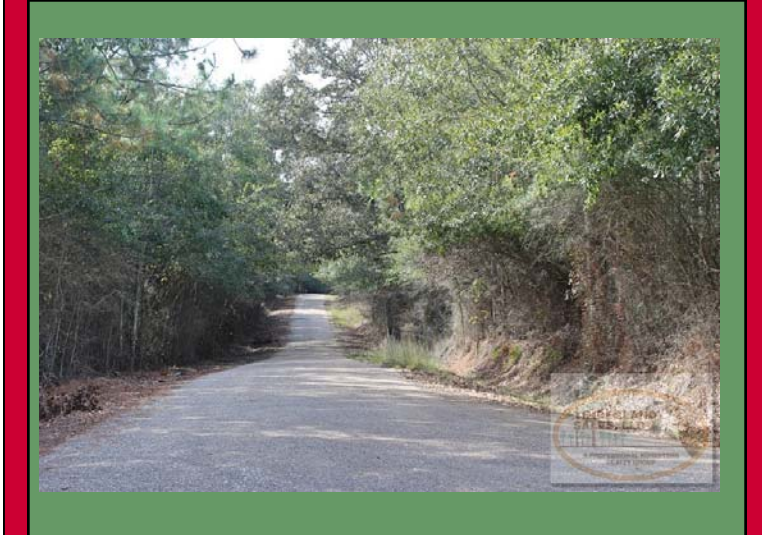
View West of Herbert Thomas Road