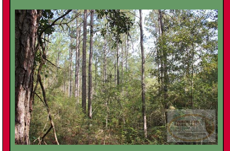
View East from Herbert Thomas Road